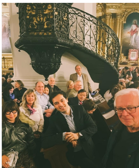
Members at the Holy Cross Church

The Chopin Society members travelled to Warsaw in October for a five-night cultural and musical programme celebrating the life and legacy of Fryderyk Chopin. Accommodation with breakfast was provided at the centrally located Novotel Warsaw Centrum, with group airport transfers arranged for members travelling on the designated LOT flights.