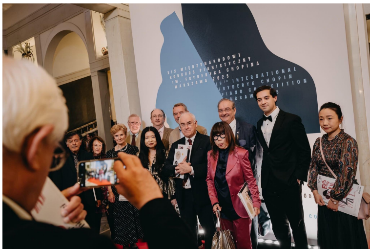
Members on the Red Carpet at Teatr Wielki